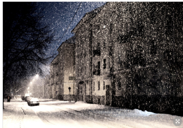
SNO-FX! is a biodegradable, non-toxic, artificial snow developed specifically to the high grade demanded by the top television and movie studios.

Other fake snow products on the market are typically made from bleached cellulose, most commonly used for attic insulation, very slow to degrade, with the balance being processed plastics, like polystyrene. SNO-FX! on the other hand, is made from non-toxic, food-grade, biodegradable materials that, like real snow, dissolve in the rain. As such, SNO-FX! has been recognized by the global film and television industry as the highest-quality, most realistic, and safest artificial snow in the world, and has appeared in Academy Award winning productions such as 'The Hateful Eight,' 'The Revenant,' and 'Interstellar'.