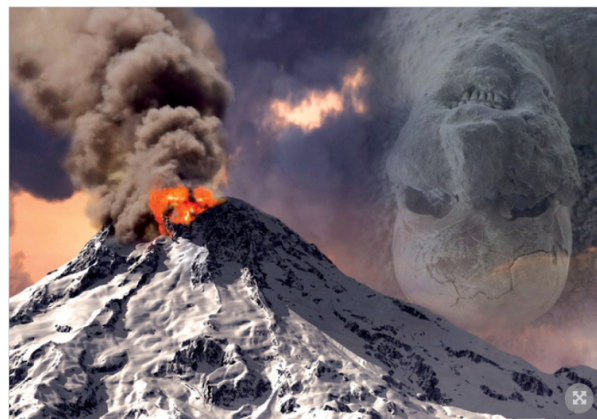
BIO-ASH is an environmentally friendly, non-toxic, non-static artificial ash.